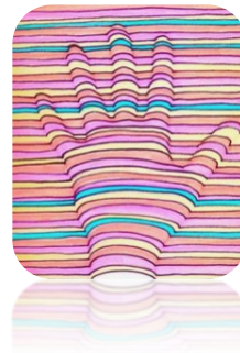
3D Optical Illusion Art!